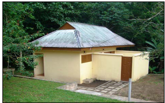
The Microsfere office in Kakum Conservation Area