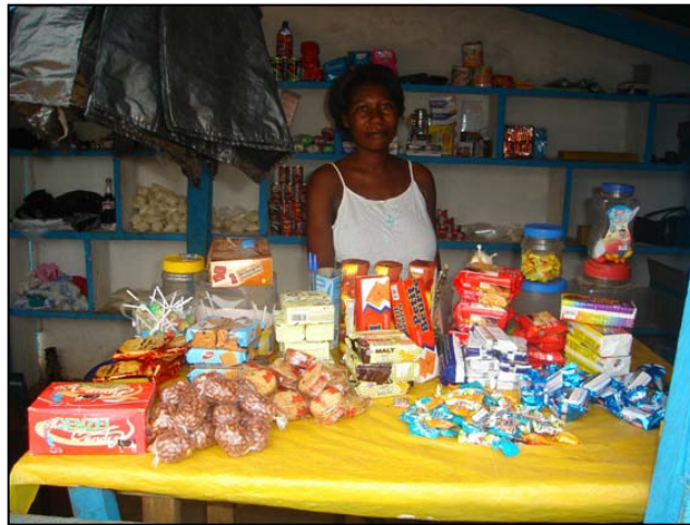
One of the project participants in Kakum Conservation Area, engaging in petty trading