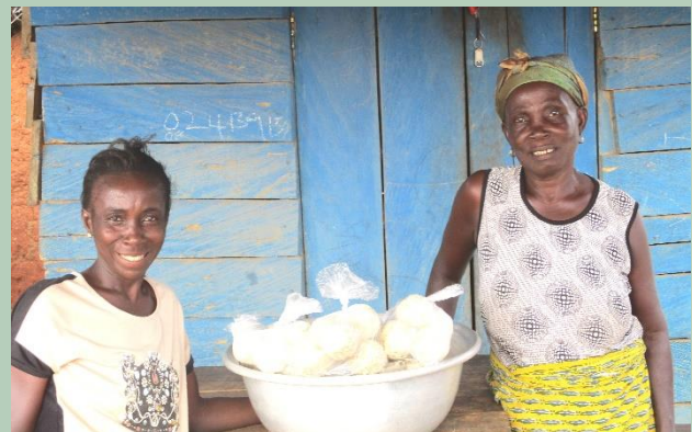
Two of the ladies producing white soap in the community of Abeka Nkwantaa

The technical support that we provide, in collaboration with our partner, the Kakum National Park management body, is of crucial importance, as beneficiaries often face technical problems that need to be dealt with. For example, grasscutters were affected by a disease and we had to explain to our beneficiaries the importance of managing their stock of animals.