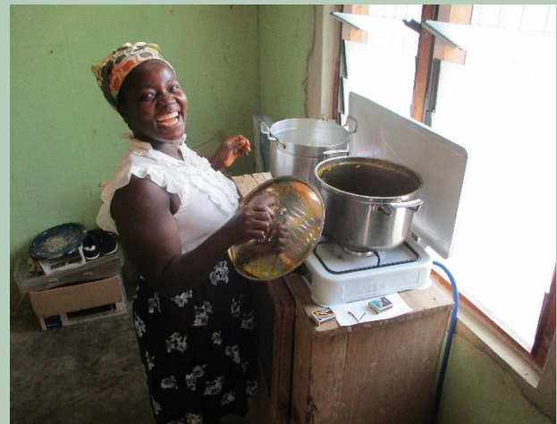
A happy cookstove user !

three months or so in one of the small rural towns nearby.